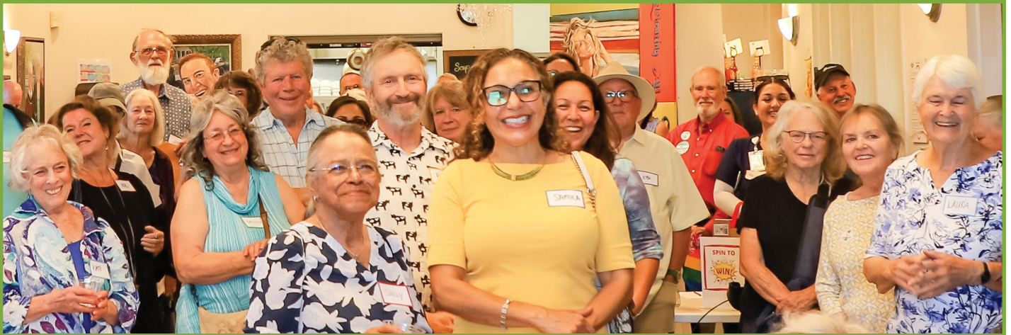
SASC Open House 2025

A Quarterly Publication for the Sebastopol Area Senior Center